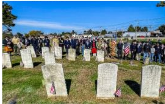
A Great turnout for our Veterans