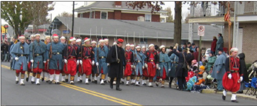
The Zouaves halt just before doing a marching maneuver to center the Company on the street.