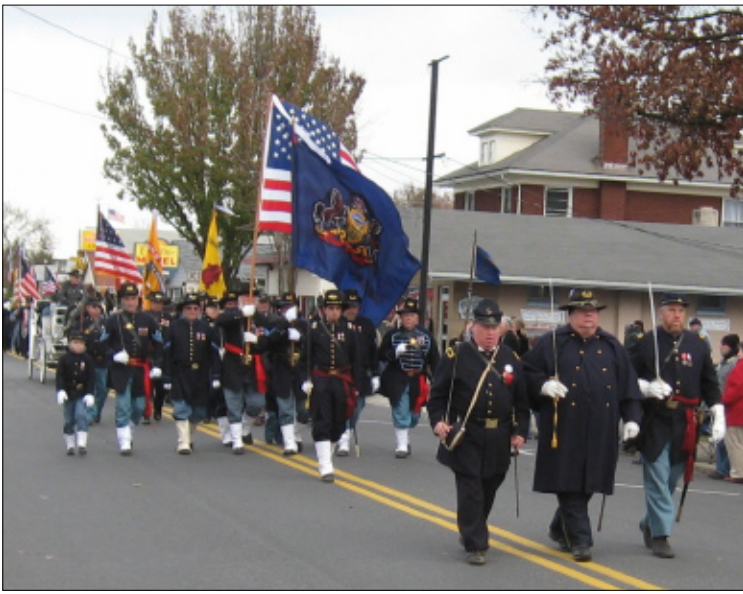
The SUVCW, SVR on the march in the Remembrance Day Parade.