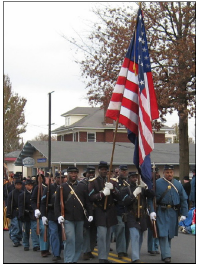
USCT on the march, over 300,000 served our nation in the Civil War. Approximately 30% of the armed forces of the United States at the end of the war were Black.