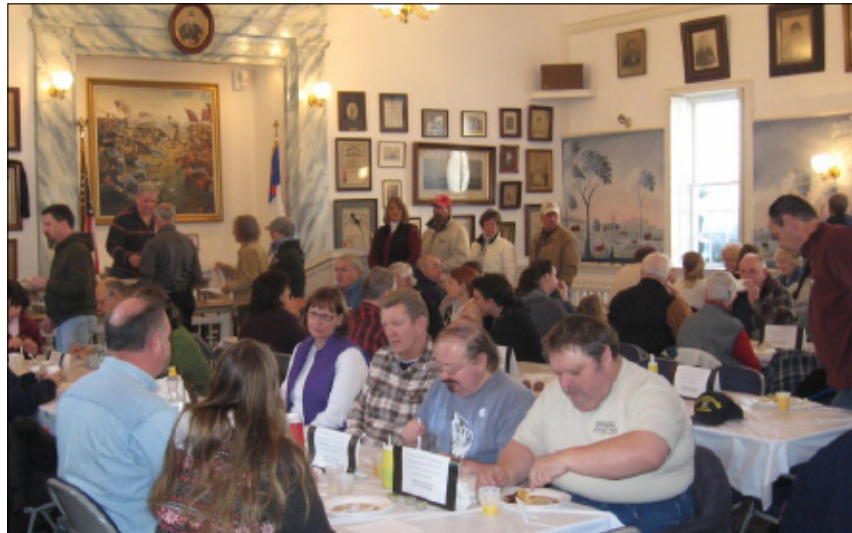
Breakfast inside the Gettysburg GAR Hall.