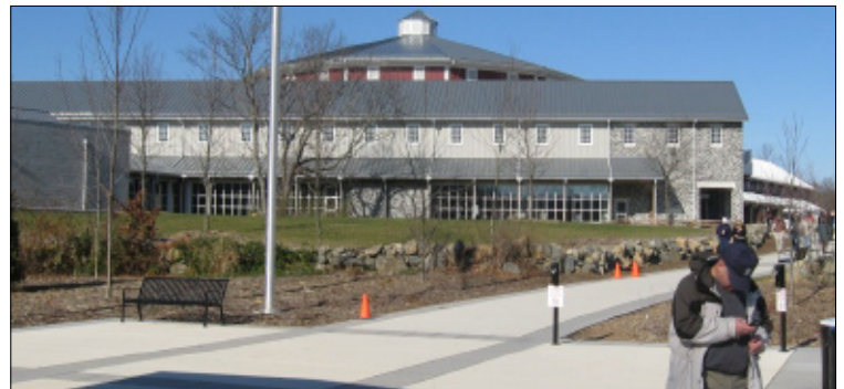
The new Museum and Visitor Center at Gettysburg National Military Park.