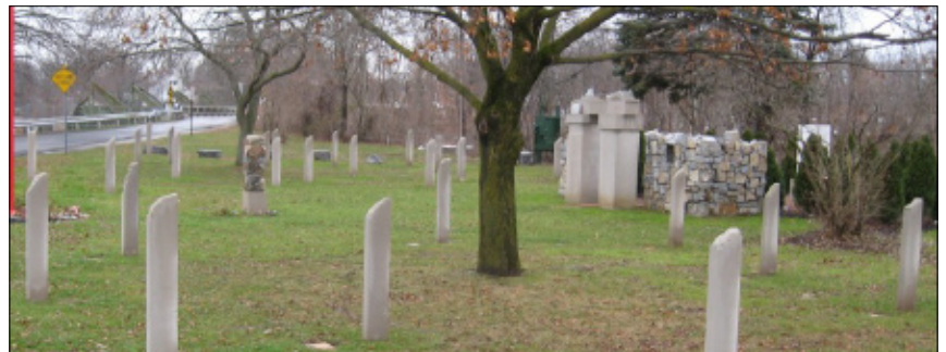
The new Waterloo Civil War Memorial. Dedicated September 19-21, 2008. Each soldier from Waterloo who died in the war has his own cenitaph with marker in addition to the main monument.