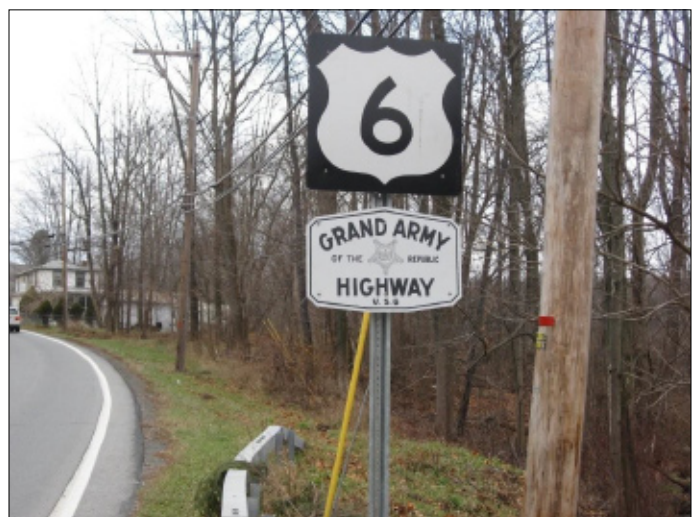
The newest sign for the Grand Army Highway, Rt. 6 in New York is up