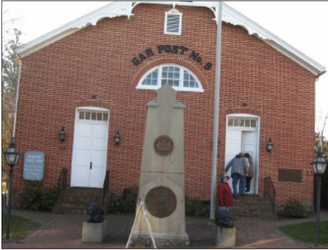
Gettysburg GAR Hall, Great place for Sunday Breakfast on Remembrance weekend.