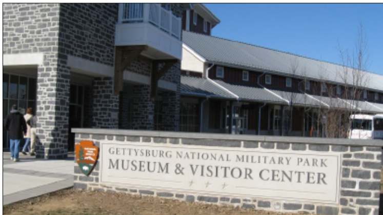
The new Visitor Center at Gettysburg National Military Park.

The building also has a large gift shop very well stocked and a large book store; one of the finest we have seen. Also there is a very nice large cafeteria with additional seating outdoors for good weather. All and all a great place to tour and get a sound basis before going out on the battlefield, we highly recommend it.