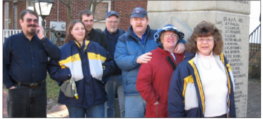
Members of Co. D7th NY Cavalry and their ladies pose after breakfast at the Gettysburg GAR Hall.