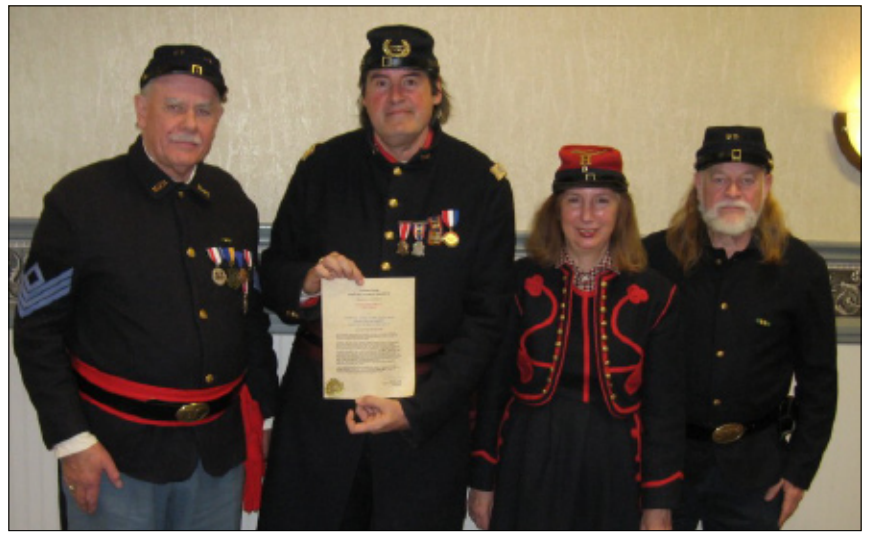
Co. I 183 NY Vol. Infrantry, SVR received the Commanding Officer's Unit Citation Award at the SVR Breakfast in Gettysburg during Remembrance Weekend.