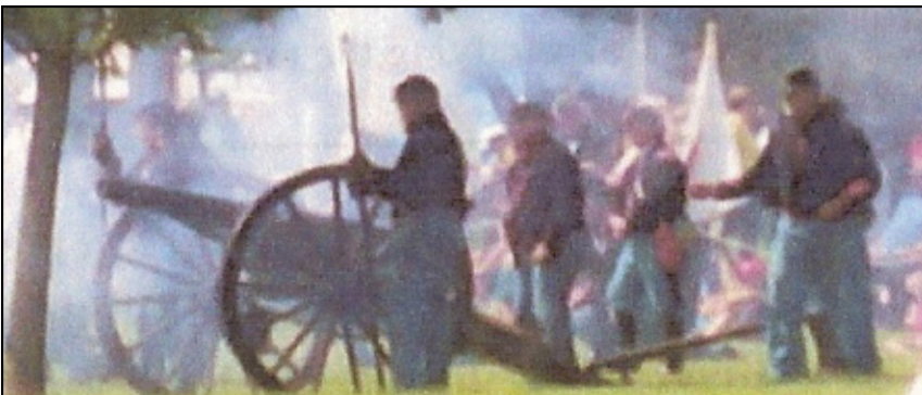
Smoke from canon lingers over the battlefield as the first day of Gettysburg is reenacted during the Amherst Museum's Civil War days.