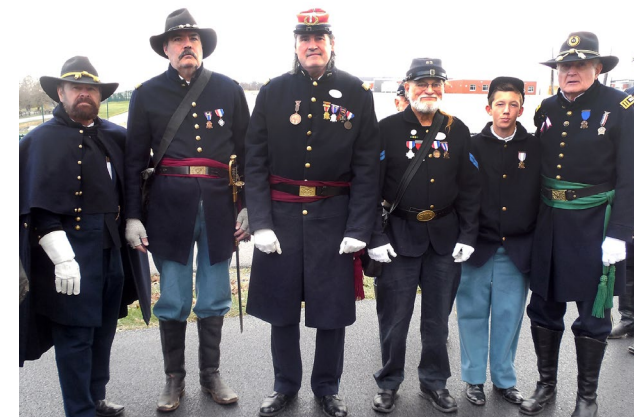
Department of New York represented at the Remembrance Day Parade, Gettysburg, Penn. on 15 November 2014

The hope of the Sgt. Judson Hicks Camp was to make Christmas extra special for the veterans and their children.