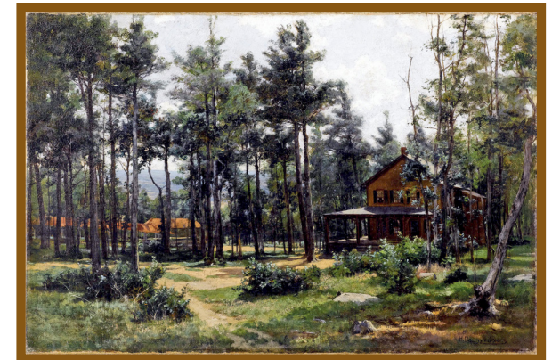
Ulysses S. Grant Cottage at Mount McGregor