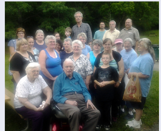
Members of the Auxiliary to the SUVCW #72 Ovid and D. G. Caywood Camp #146 at their summer picnic, held August 27, 2013 at Sampson State Park on Seneca Lake

Over the next three days, these same men would kill each other and the Battle of Stones River, though inconclusive, would result in the highest percentage of casualties suffered on both side during the entire Civil War.