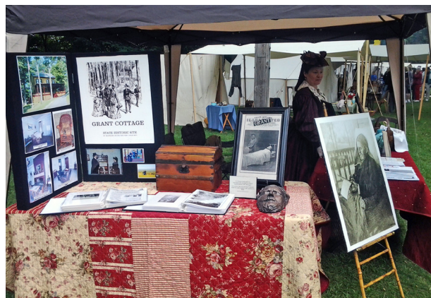
Grant Cottage exhibit at the Saratoga 150 Festival encampment in Saratoga Springs

The facility originally opened in 1913 as a sanatorium for Metropolitan Life Insurance Company employees suffering from tuberculosis. The buildings' 100th anniversary was observed in September 2013 at the prison and at the Grant Cottage State Historic Site. Mount McGregor has been a prison since 1976.