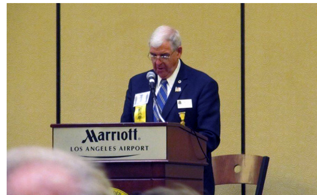
Commander in Chief Mellor addressing the 2012 National Encampment