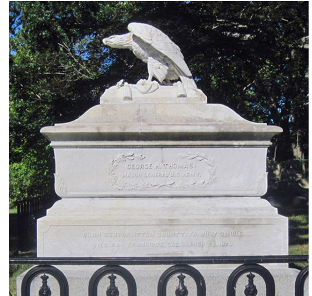
Photograph taken after cleaning Summer 2012