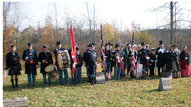
All the participants at the Gooding gravesite in Concordia Cemetery