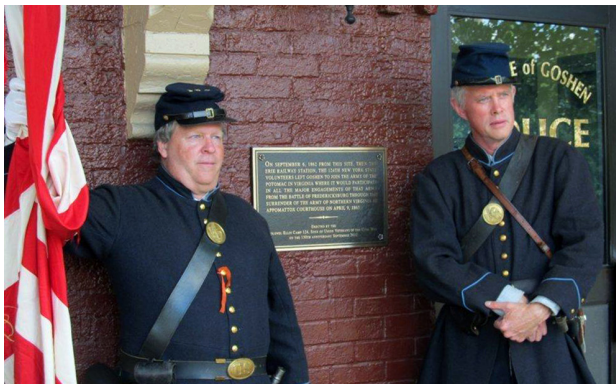
New historical marker in place at the former station

Funds for the marker were raised through a grant from the Orange County Historian's office and from fund raising by the camp. The original train station, which still exists, now serves as the Village of Goshen Police Department. The 124th New York served in the Army of the Potomac in all of its major engagements from Fredericksburg to Appomattox Courthouse. At Gettysburg its Colonel and Major were killed, and Lt. Colonel wounded, during the regiment's defense of the triangular field at Devil Den. The regiment's action at Chancellorsville is thought to be the basis of Stephen Crane's Red Badge of Courage who interviewed its veterans while writing the novel in Port Jervis, New York.