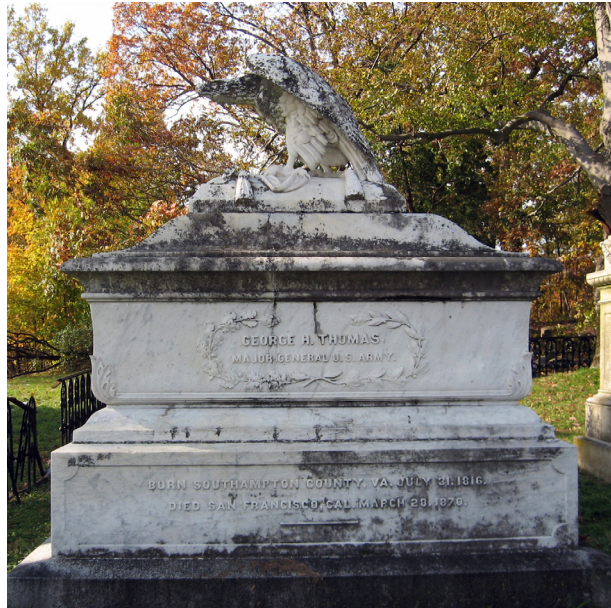
Photograph taken before cleaning Fall 2011