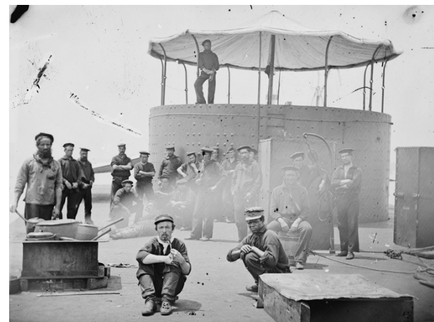
Crew members cooking on the deck of the Monitor, in the James River, Virginia, 9 July 1862

Events currently planned include a Parade, a concert at the Church of the Ascension at Greenpoint, a history fair and a U.S.S. Monitor 150th anniversary reception. The Church of the Ascension at Greenpoint is connected to the U.S.S. Monitor as Thomas Fitch Rowland, close personal friend of John Ericsson and owner of Continental Iron Works who assembled the Monitor, was a member of this congregation and used