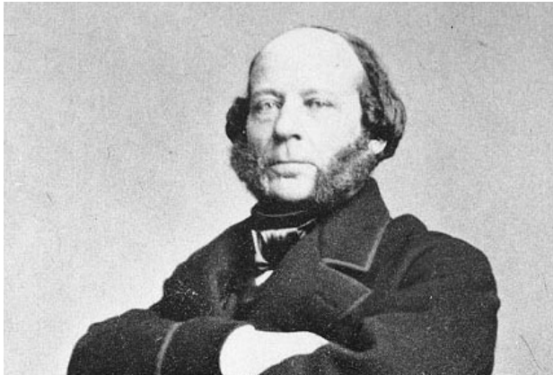
Swedish-born designer John Ericsson