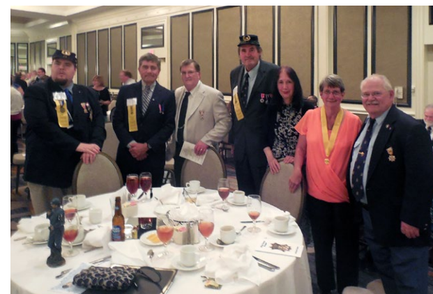
Members of the Department of New York at the 2015 National Encampment in Virginia