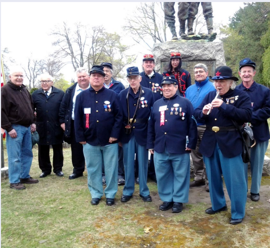
Delegates standing at the GAR memorial in Mt. Hope Cemetery following the 131st N.Y. Department Encampment in Rochester