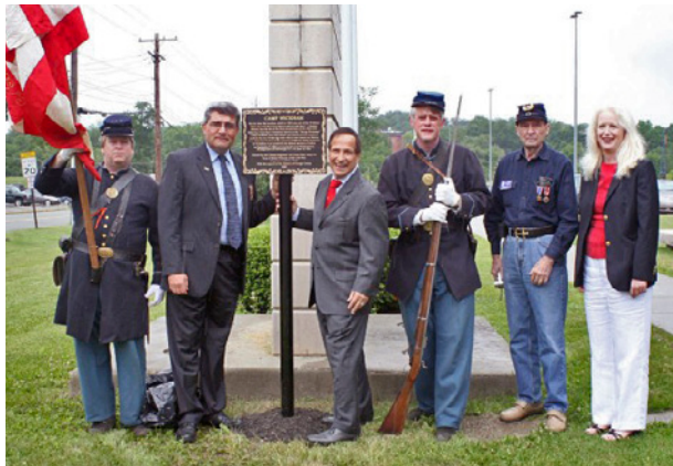
Camp Wickham Dedication Event on June 14