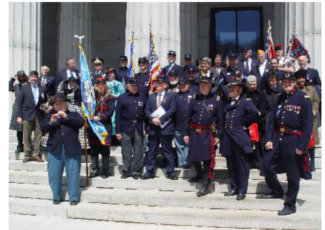
The General Grant Birthday Commemoration at the Grant Monument