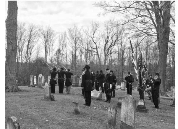
The rifle squad represented by members of the Weber Guard and Company A, U.S. Engineer Battalion, fires the salute during the ceremony.