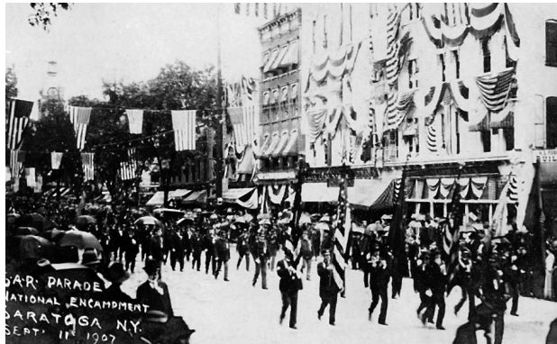
GAR Parade National Encampment, Saratoga 1907

Communities such as Rochester, Utica, Buffalo and Syracuse tended to be sites for New York Department encampments, but Seneca Falls, Auburn and Lake Placid were also sites. Municipalities sought the encampments in part for the honor of celebrating the