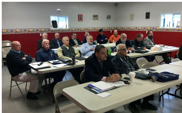
Mid-Year Meeting in Bridgewater, N.Y.

I am happy to report on a number of recent events and efforts and activities currently underway throughout your Department.