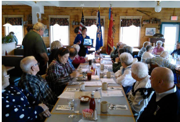
Lincoln Camp No 6 Remembrance Day Dinner