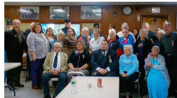
Testimonial Dinner in Ovid, N.Y.