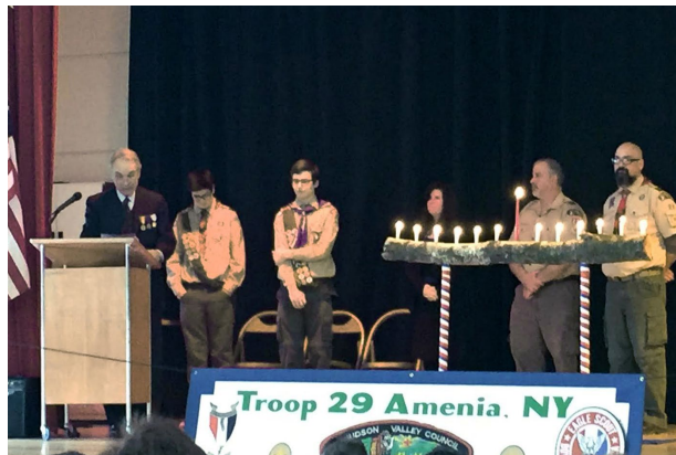
Troop 29 Eagle Scout certificate presentation in Amenia, N.Y.