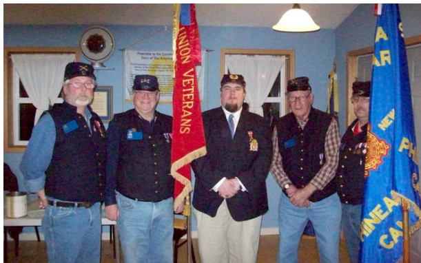
Phineas Catlin Camp No 341 of Odessa, N.Y.

On March 7th, 2016, the Phineas Catlin Camp No 341 of Odessa, N.Y.'s meeting was held at their