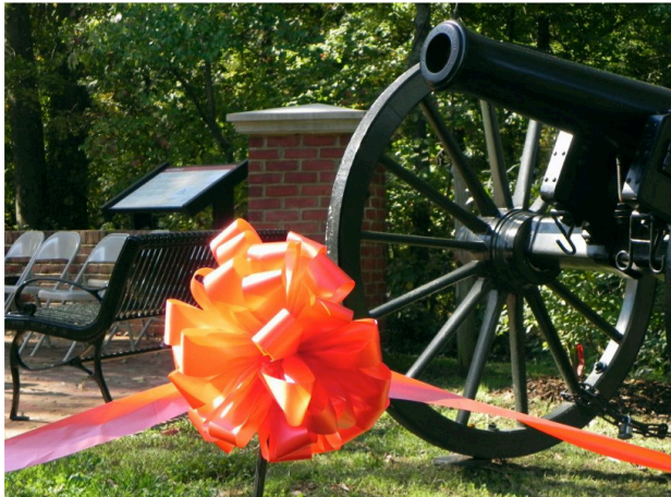
Fort Willard Historic Site just before the formal ribbon-cutting ceremony on October 15, 2011