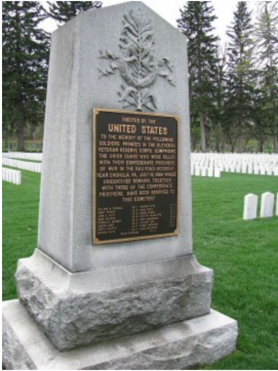
The Shohola monument at Woodlawn Cemetery in Elmira.

On July 15, 1864 a prison train containing 833 Confederate prisoners of war, mostly captured at Cold Harbor Virginia in early June 1864, and 128 Union soldiers from the 11 th and 20 th Veteran Reserve Corps headed north from Jersey City along the Erie Railroad tracks on their way to the recently opened Elmira prisoner of war camp in Elmira, New York. The train was delayed and arrived in Port Jervis, New York four hours behind schedule. The train then crossed over into Pennsylvania and headed on a single track along the Delaware River. Unbeknownst to the prison train engineer, a coal train was negligently allowed by a Telegraph operator up the line to continue southbound on the same track. At about 2:45PM in the town of Shohola, Pennsylvania on a blind curve