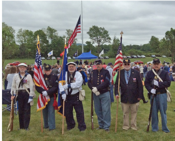
Color Guard (Memorial Day, May 28) at Gerald Solomon National Cemetery, Saratoga)