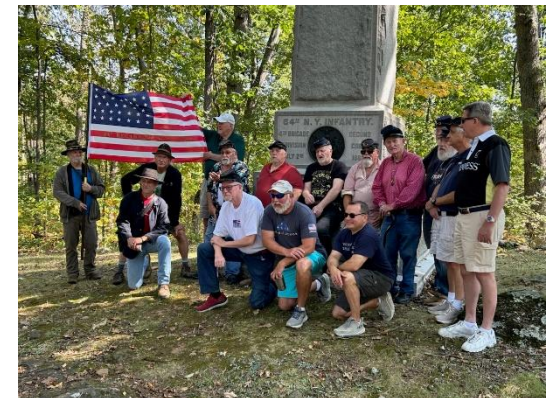
The older members of the 148th NYSV at Gettysburg this past Saturday (9/20)