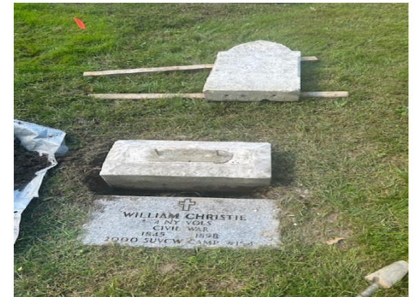
Re-setting the original grave stone of William Christie, 4thNY, in New Mt. Ida Cemetery.

During this round of work 55 monuments were conserved in New Mt. Ida Cemetery. With 63 conserved during the spring effort, the total for 2024 is 119 monuments! Our final work party will be held during the Spring of 2025. At that time we will have expended our total ARPA allocation.