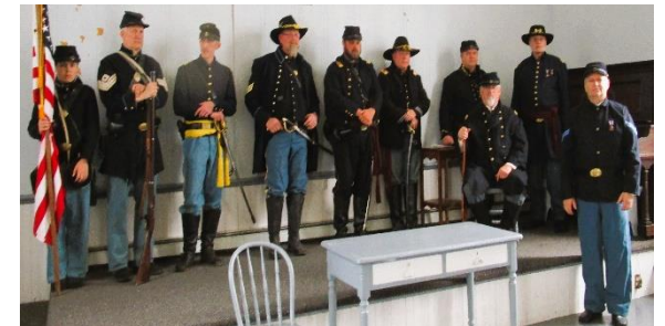
Members of the 1stNY Dragoons, Lincoln Camp #6 and 126thNYSVR

To date, Lincoln Camp has acquired five historical marker grants from the Foundation. We show our appreciation by reading their congratulatory letter at marker dedications, and we provide images of the installed marker as they request and require.