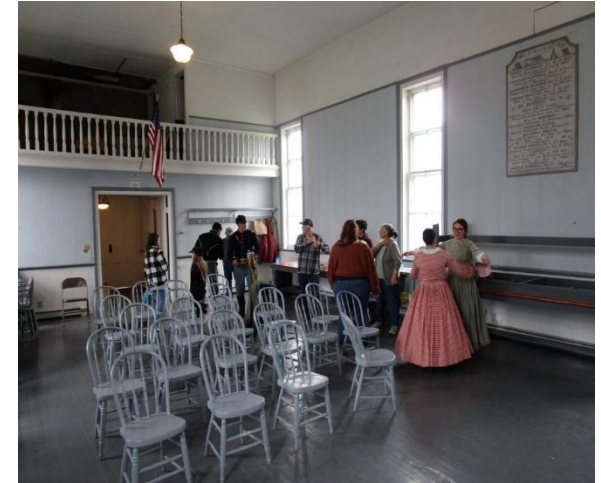
Interior view of the GAR hall.

As it happened, the town of Portage had received grant money from New York State for remedial work on the hall. Installation and dedication of the marker was delayed by this necessary work. Water was removed from the basement. Grounds work was done to prevent water seepage. Some asbestos was removed. The front doors were removed, restored, and reinstalled. The grant monies expired before the town could find a contractor to build an accessibility ramp to the rear door at an affordable price. With some major work done, and no future work scheduled, it was time to install and dedicate the marker.