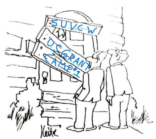
I think we skipped too many meetings.

Thank you for your cooperation. Please contact me, or the Department Secretary if you need help, or you anticipate not making the deadline dates.