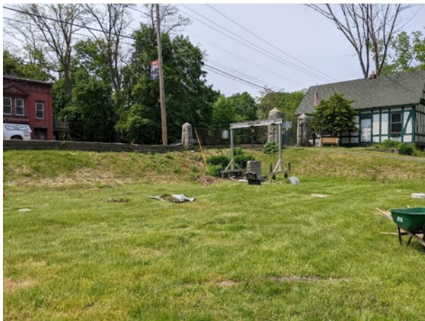
Figure 1. Image at the entrance of Old Mt. Ida Cemetery just as work commenced on May 22

[2] https://glwillard154.org/about-the-camp/officers/past-commanders-of-154