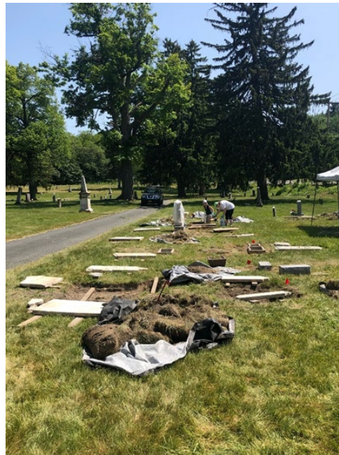
Figure 3. Volunteers working on uncovered monuments.