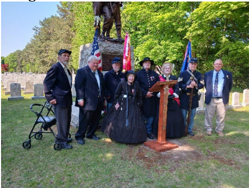
Members of Lincoln Camp #6 and the DUVCW at Holy Sepulchre Cemetery in Rochester