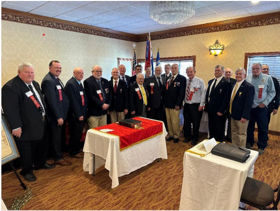
The Department of New York officers for the next term.

The 140 th Encampment of the Department of New York-May 5-7 in Callicoon.