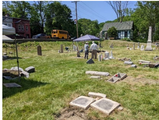
Figure 2. Looking back to the same area on May 30. About 18 monuments were uncovered and/or restored.