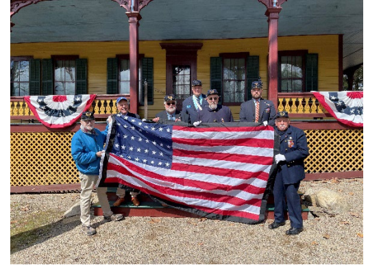
American 38 star flag with 2" black border ordered for Grant Cottage.