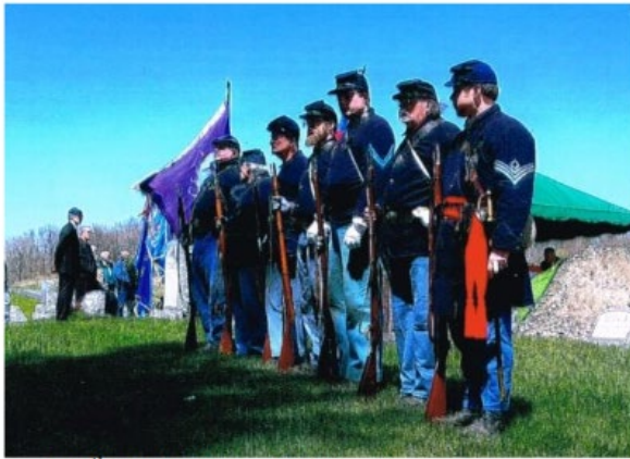
148 th NY Infantry, SVR at burial service