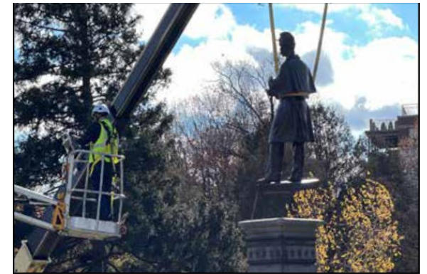
Civil War soldier's statue just before it reaches the monument on which it will rest.

The original monument was built and dedicated in 1875 and cost $3000, or an astounding $76,000 in 2021-2022 dollars. It consists of a slightly larger than life soldier and a twelve foot granite base. Others in attendance at the event were relatives of members of the 77th, local politicians, media, city workers and interested bystanders.