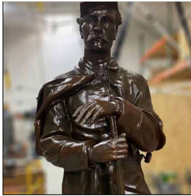
The bronze sentinel stands ready to retake his place on the 77 th Regiment's monument in Saratoga Springs,

It took over a year, but the statue atop the 77th NY Volunteer Infantry (NYVI) monument, that was destroyed on July 16, 2020, is now back in place.